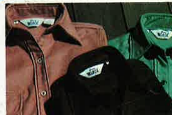
Three new colors

Address correction requested If possible, peel off label and affix to order blank.